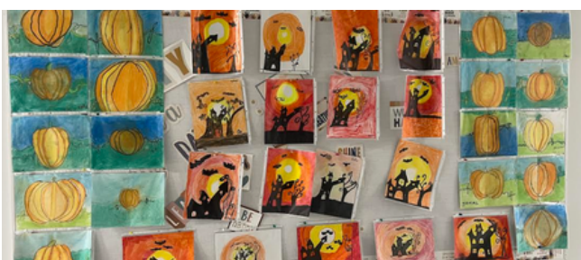
Halloween Art from Malmo School students

Malmo Community League is working on building a stronger connection with Malmo School, the beautiful school beside our community hall. Currently we are getting the ball rolling on a Reading Buddy program. If you are interested in volunteering, please email treasurer@malmoplains.com