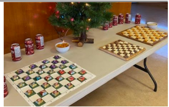
Christmas Chess Club Party in December