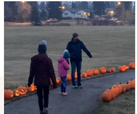
Last year's Pumpkin Parade at Lendrum Park.