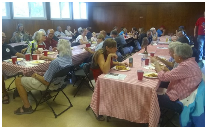
Spaghetti Dinner Sept 16, 2023

*Please reach out to social@malmoplains.com for more information.