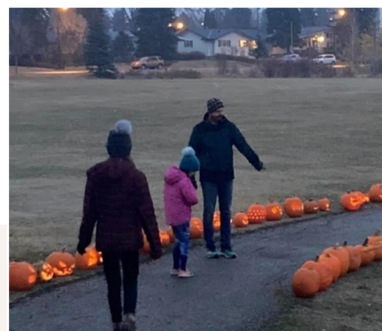
Last year's Pumpkin Parade at Lendrum Park.