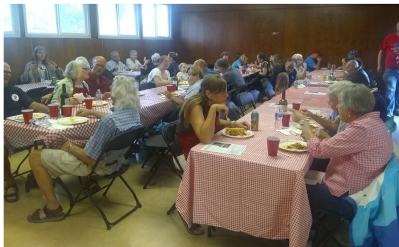
Spaghetti Dinner Sept 16, 2023

*Please reach out to social@malmoplains.com for more information.