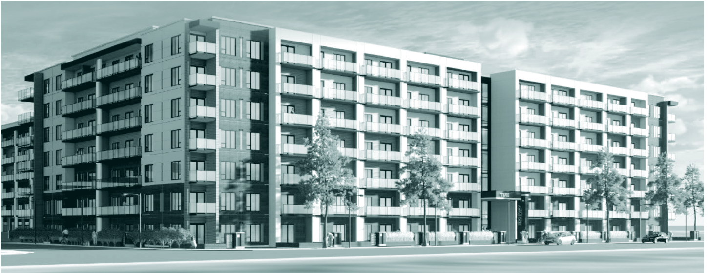
Conceptual rendering of one of the proposed three new mid-rise residential complexes in Edgeway.