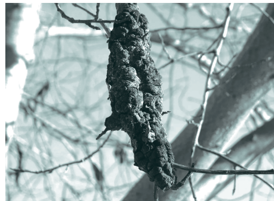
Black knot affects many trees in Malmo Plains and can eventually kill the entire tree.

Black knot fungus is a common tree disease caused by the fungus Apiosporina Morbosa . It mostly affects species of cherry and plum trees, including the May Day chokecherry trees common to Malmo Plains.